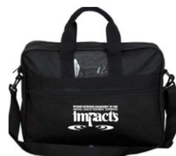
Messenger Bag with Shoulder Strap