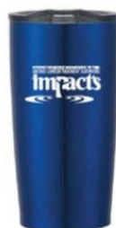
20 oz / Stainless Steel Tumbler