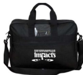
Messenger Bag with Shoulder Strap