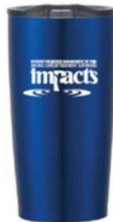
20 oz/ Stainless Steel Tumbler