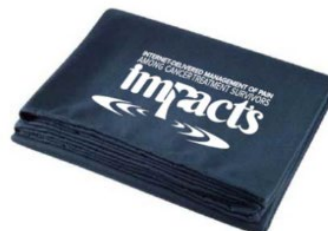
Sweatshirt Blanket, 50" x 60"