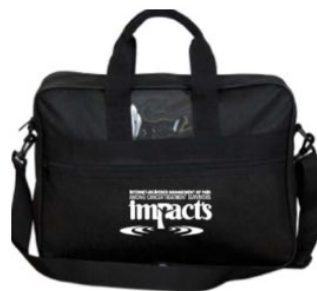
Messenger Bag with Shoulder Strap